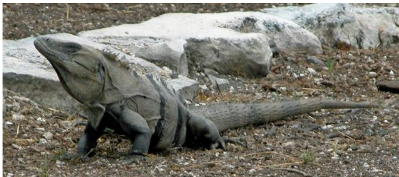
Not a common anole but the word is it taste like chicken

For all of these apps, be aware that the identifications are the best the app can provide and are suggested identifications. Before you pull up that mulberry sapling that was misidentified as ragweed (because they look similar when all you use is a young leaf...just ask Sarah Lea about this...), double check all of your information. Make sure that the identification makes sense for the habitat, climate, and general location. It should be obvious that one should NEVER use an app identification as the sole information if you plan to EAT the plant, mushroom, etc...just say “no” to that idea. Other than avoiding plant or mushroom identification for culinary purposes, we highly recommend that you download one or more of these apps and go have some fun identifying birds and other organisms!